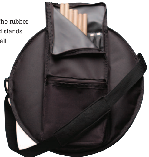
The D-Lux carrying bag can contain the pad and all inserts for easy portability. It can also accommodate sticks and accessories.

The All-N-1's price may seem a little steep for a single pad. But the pad is really a complete system, with quite a bit of versatility to offer. As such, it's almost a must for teachers or players with a dedicated practice regimen. Get one and you'll get some serious practicing done.